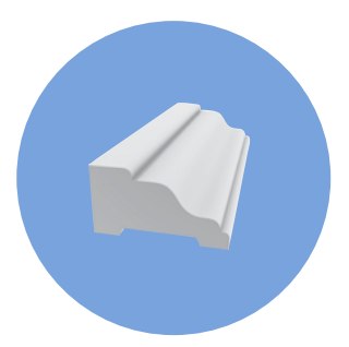
Rake Mould 1" x 2" x 16' 10/bundle