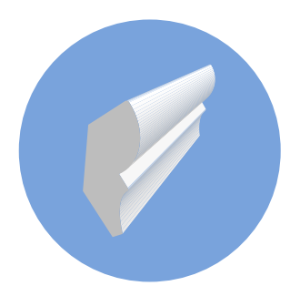
Bed Mould 9/16" x 1-9/16" x 16' 25/bundle