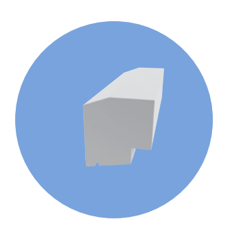
Historic Sill 1-3/4" x 2" x 16' 4/bundle