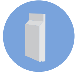
Skirt Board Woodgrain and Smooth 4/4" x 6" x 18'