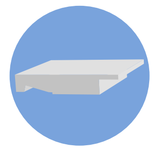
J-Channel with Flange Woodgrain and Smooth 5/4" x 6" x 18'