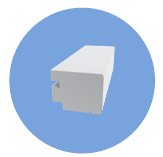
Large Historic Sill 1-3/4" x 2-3/8" x 16' 2/bundle