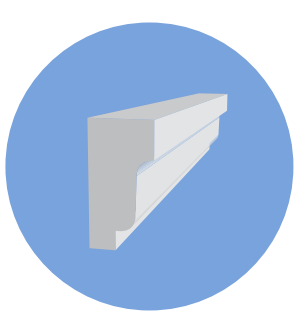
Solid Crown 1-1/8" x 2-1/4" x 16' 4/bundle