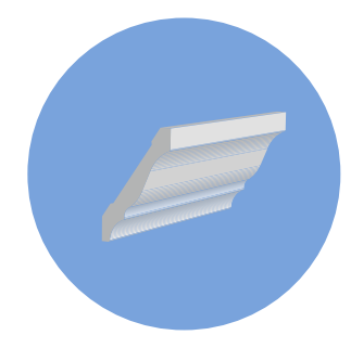
4" Crown 9/16" x 3-5/8" x 16' 10/bundle