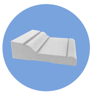
Adams Casing 1" x 3-1/2" x 16' 6/bundle