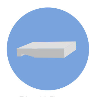
Trim with Flange Woodgrain and Smooth 5/4" x 6" x 18'

Availability of any Skytrim product is dependent on dealer inventory and may require minimum order quantity.