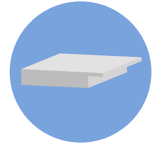
Standard J-Channel Woodgrain and Smooth 5/4" x 6" x 18'