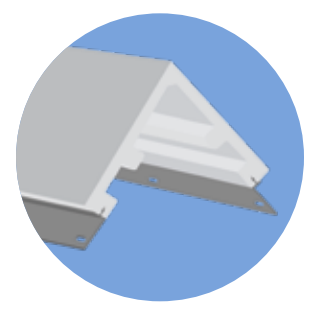
5½" with Hinged Nailing Fins Smooth 5½" x 5½" x 20'