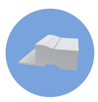
Brick with 1" Nail Fin 1-1/4" x 2" x 18' 6/bundle