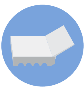
Weather Stop 7/16" x 2" x 16' 15/bundle