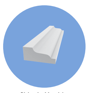
Shingle Mould 11/16" x 1-5/8" x 16' 20/bundle