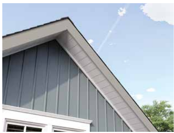
Beadboard and Trimboards in Sand.

You'll find Skytrim products in white , sand , and clay . Our range of neutral trimboard and sheet shades give you the flexibility to complement any siding color, from lighter shades to bolder ones. So you're guaranteed to create the right expression.