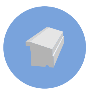
Sub Sill Nose 1-1/2" x 1-5/8" x 16' 6/bundle