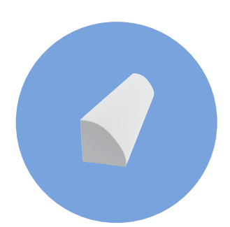
Quarter Round 3/4" x 3/4" x 16' 25/bundle