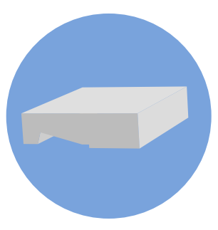
Trim with Flange Woodgrain and Smooth 5/4 x 4" x 18'