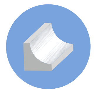
Scotia Cove 3/4" x 3/4" x 16' 25/bundle