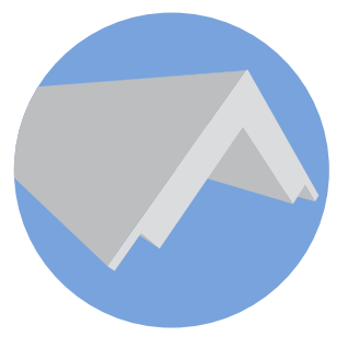
Rabbeted Outside Corner Woodgrain and Smooth 5/4" x 6" x 6" Lengths: 10' and 20'