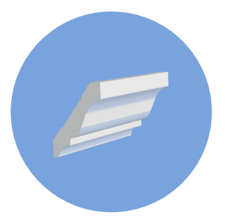
3" Crown 9/16" x 2-3/4" x 16' 10/bundle