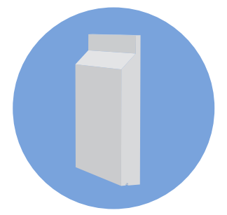
Skirt Board Woodgrain and Smooth 5/4" x 8" x 18'