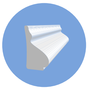
Base Cap 11/16" x 1-1/8" x 16' 36/bundle