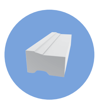
Brick Mould 1-1/4" x 2" x 17.5' 6/bundle