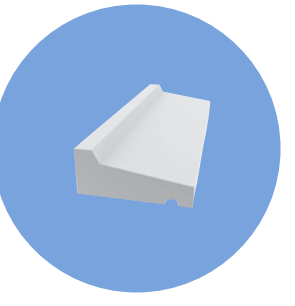
Drip Cap 11/16" x 1-5/8" x 16' 20/bundle