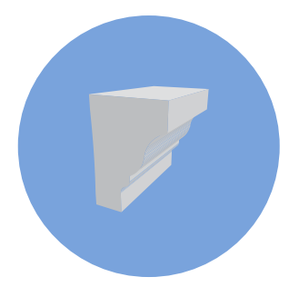
Rams Crown 1-3/8" x 2-1/16" x 16' 6/bundle