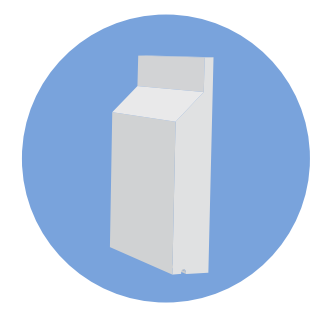
Skirt Board Woodgrain and Smooth 5/4" x 6" x 18'