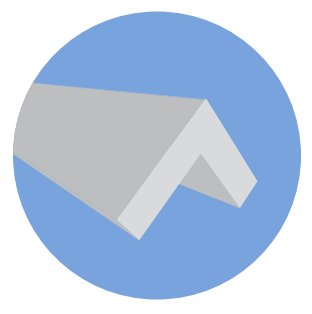
Outside Corner Woodgrain and Smooth 5/4" x 4" x 4" Lengths: 10' and 20'